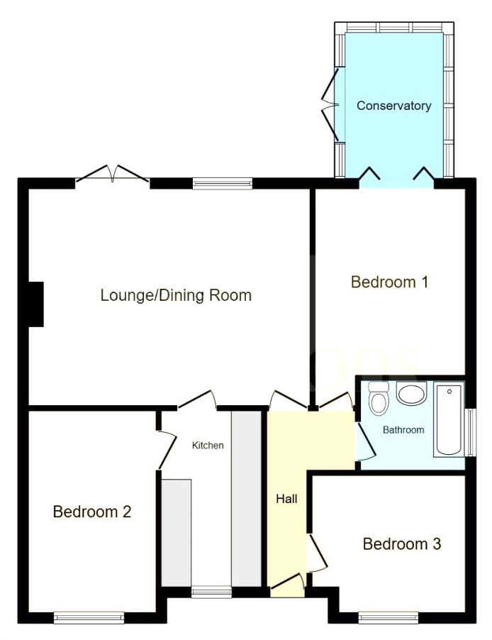
Total floor area 76.9 m² (828 sq.ft.) approx

This floorplan is for illustrative purposes only and is not drawn to scale. Measurements, floor-areas, openings and orientations are approximate. They should not be relied upon for any purpose and do not form any part of an agreement. No liability is taken for any error or mis-statement. All parties must rely on their own inspections.