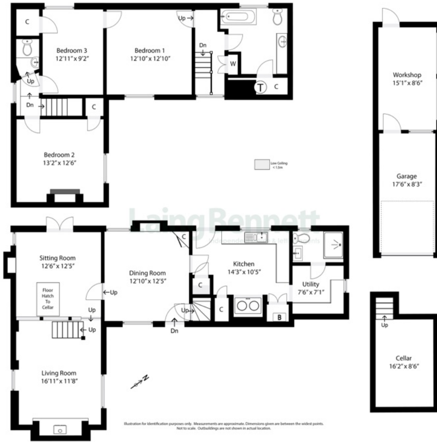
Illustration for identification purposes only. Measurements are approximate. Dimensions given are between the widest points. Not to scale. Outbuildings are not shown in actual location.

Approximate Gross Internal Area (Including Low Ceiling) = 144 sq m / 1552 sq ft Cellar = 11 sq m / 118 sq ft Outbuildings / Garage = 26 sq m / 278 sq ft