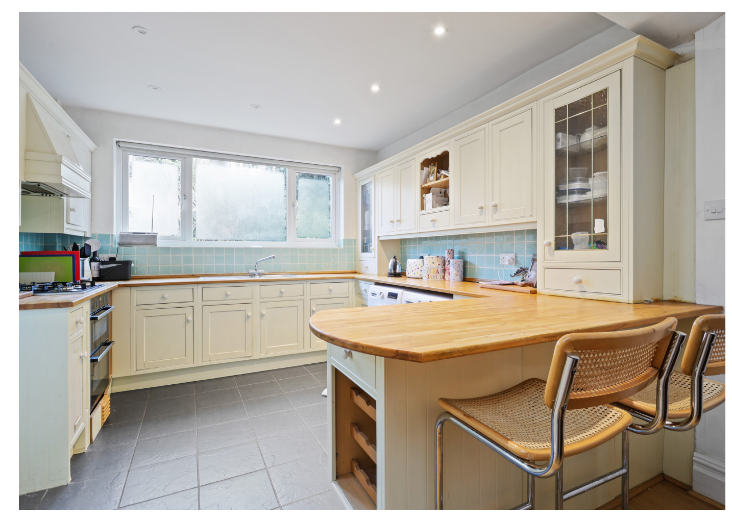
5 BEDROOM HOUSE