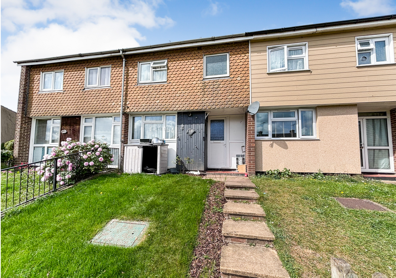
Dulnan Close, Tilehurst, Reading, Berkshire.