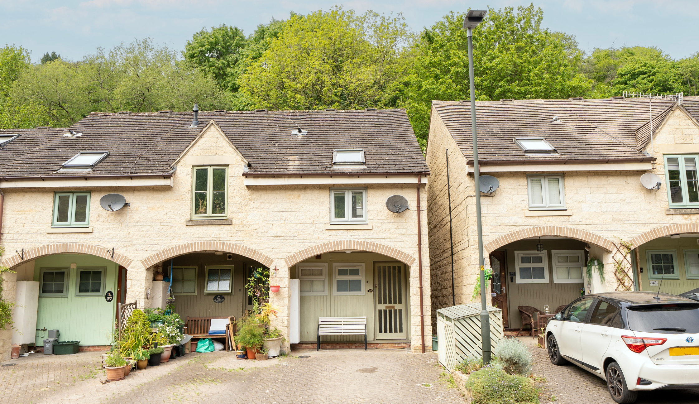
39 Belvedere Mews, Chalford, Gloucestershire, GL6 8PF £265,000