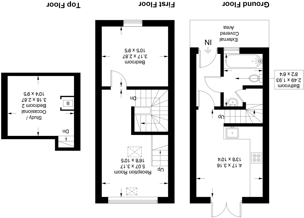
Illustration for identification purposes only, measurements are approximate, not to scale. (ID1200098)