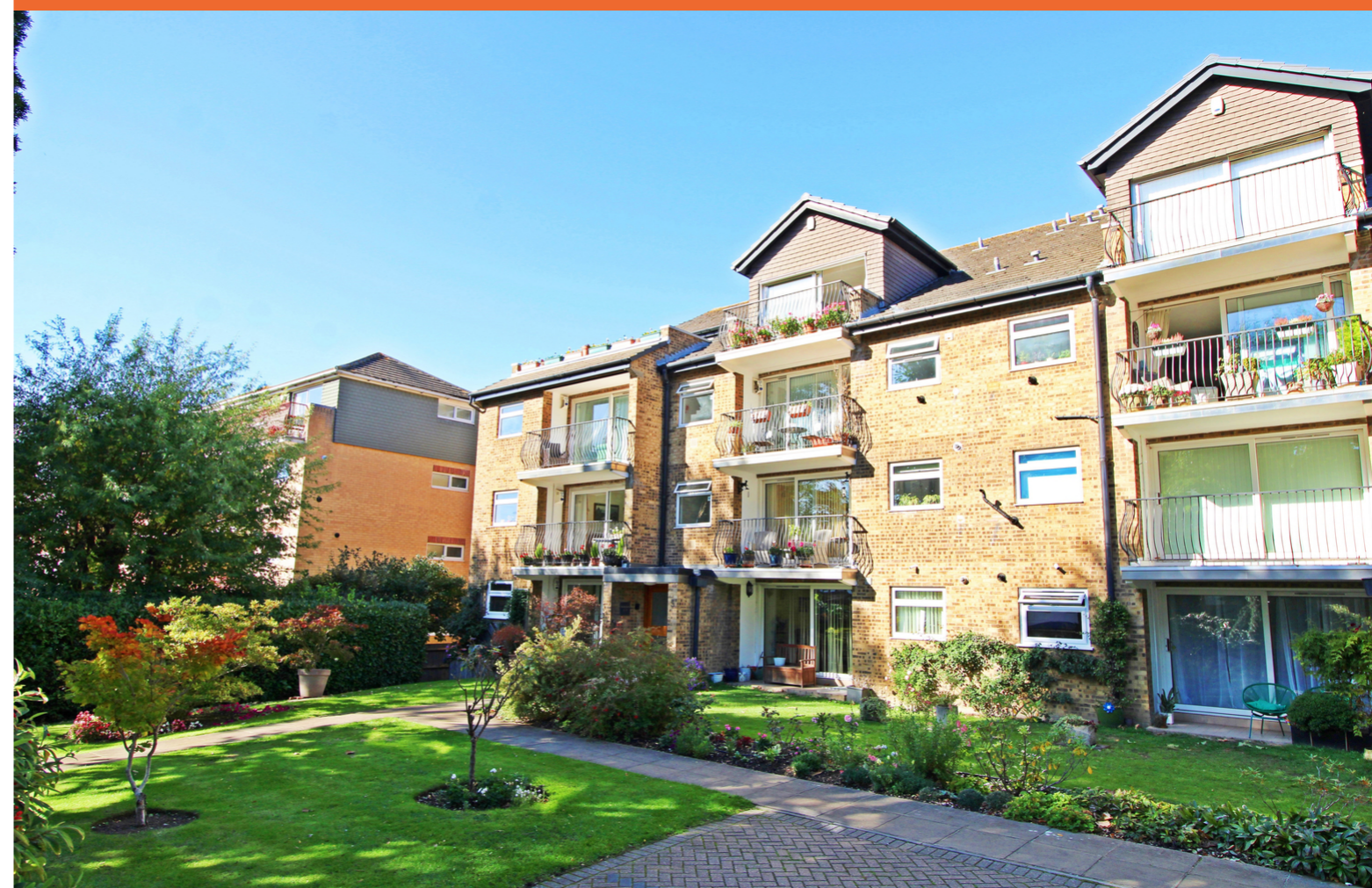
Top Floor Penthouse 161.6 sq.m. (1739 sq.ft.) approx.