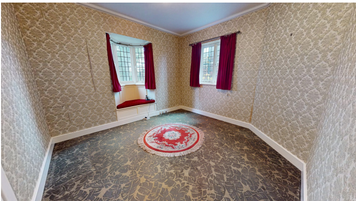
Reception Room 5