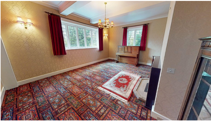
Reception Room 4