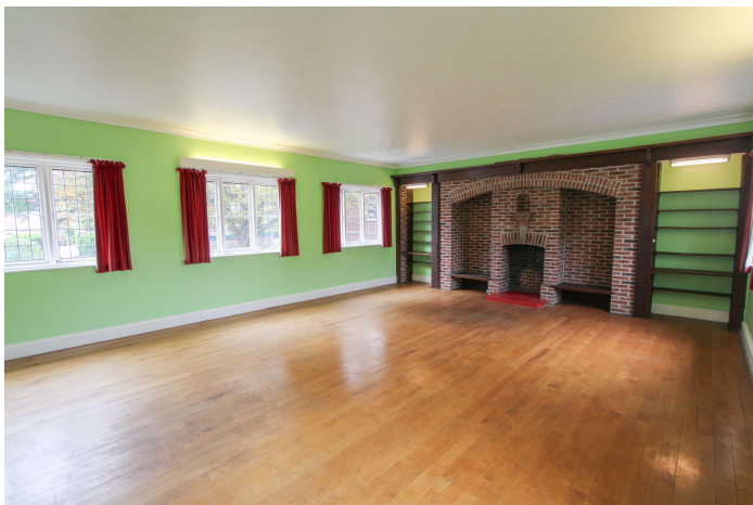
Games Room (Above Garage)