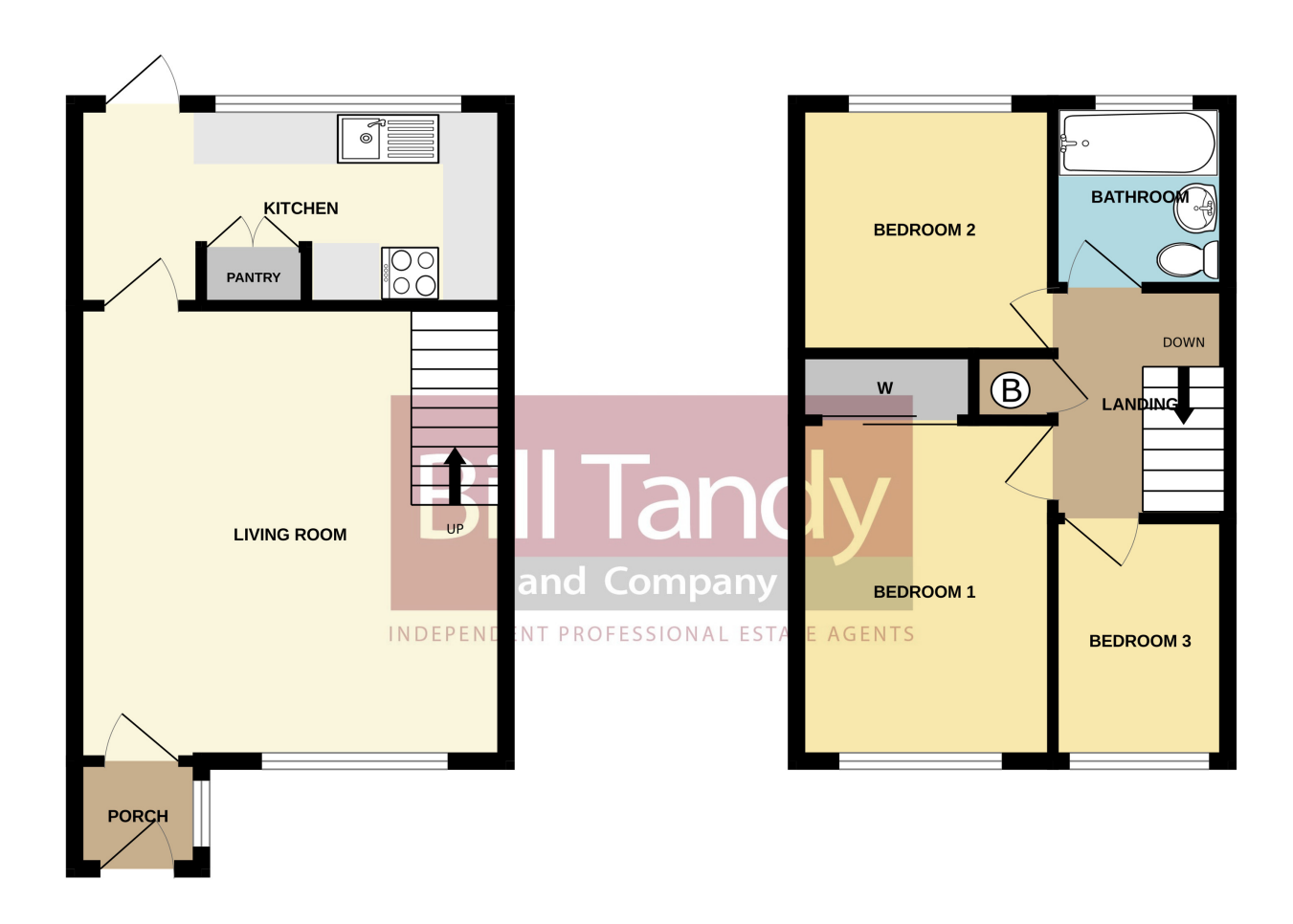
TOTAL FLOOR AREA: 665 sq.ft. (61.8 sq.m.) approx. Whilst every attempt has been made to ensure the accuracy of the floorplan contained here, measurer of doors, windows, rooms and any other items are approximate and no responsibility is taken for any e omission or mis-statement. This plan is for litisustrate purposes only and should be used as such by prospective purchaser. The services, systems and appliances shown have not been tested and no guar as to their oorarbility or efficiency can be given.