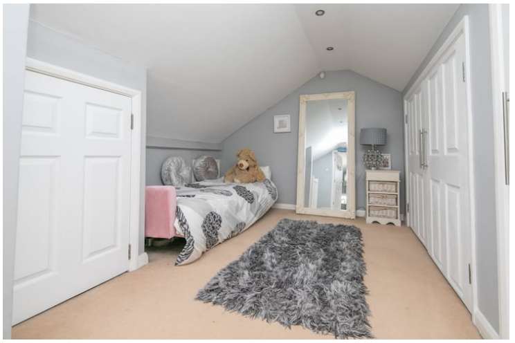
13'11" x 9'0" (4.24m x 2.74m) Sky light, wardrobe with 3 doors, eves storage, inset spot lights, currently used as a bedroom.