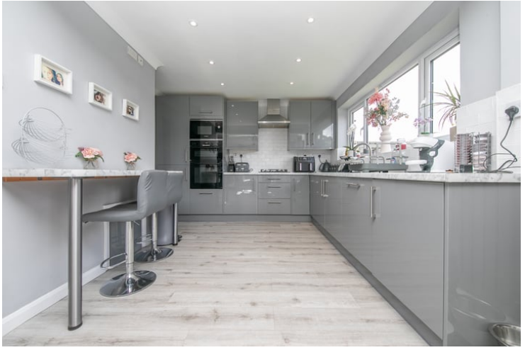
13' 10" x 9' 05" (4.22m x 2.87m) Double glazed window to rear, vertical radiator, fitted modern grey gloss kitchen including a range of wall and base units, laminate work surface, breakfast bar, integrated stainless steel sink, double oven, microwave, gas hob over head extractor fan, fridge, pantry storage cupboard.