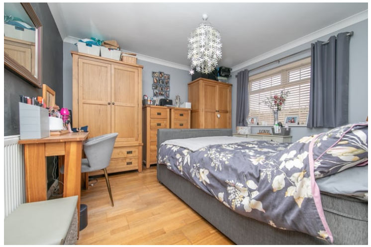
12'01" x 11'05" (3.68m x 3.48m) Double glazed window to front, radiator, space for bedroom furniture.