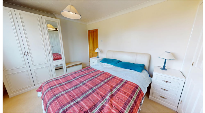
Bedroom One & W/C