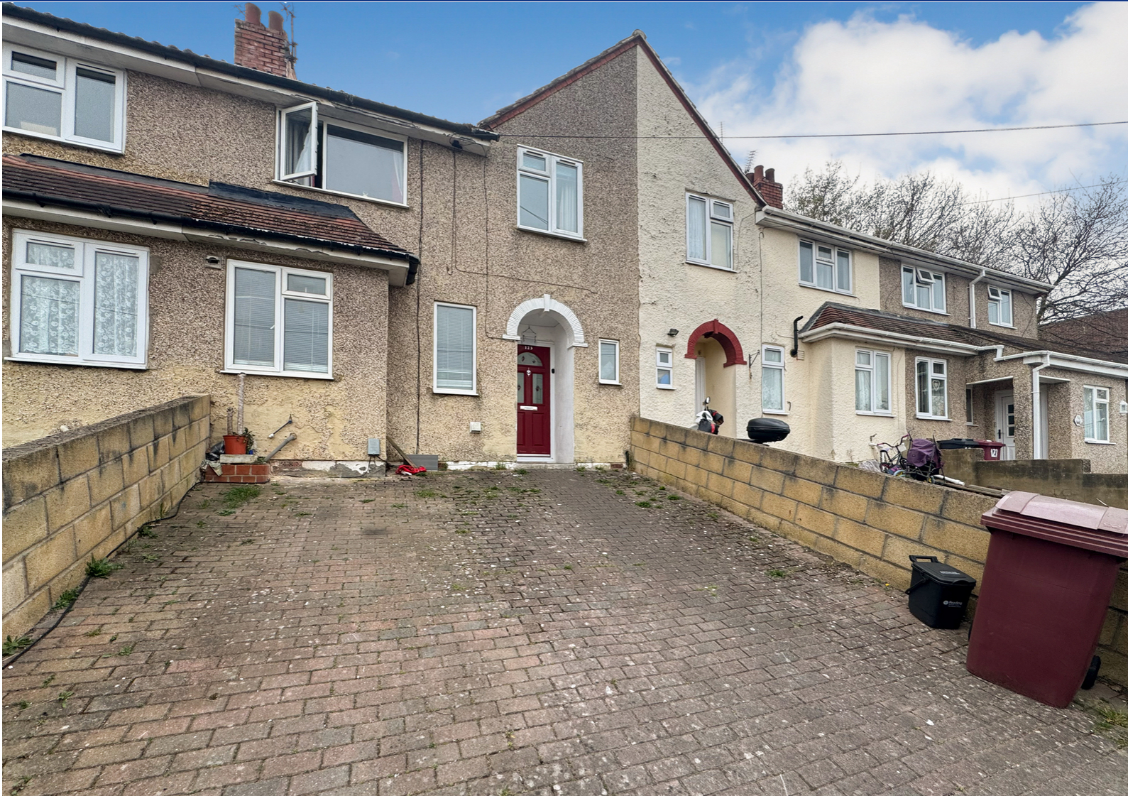
Lyndhurst Road, Tilehurst, Reading, Berkshire.