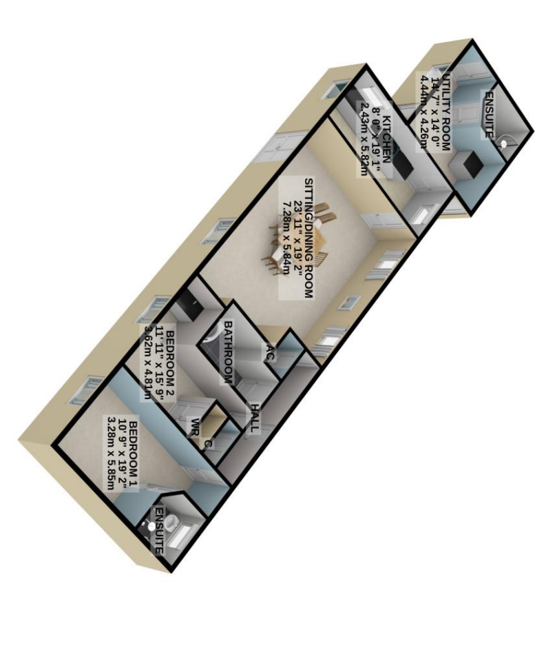
OUTBUILDINGS 3506 sq.ft. (325.7 sq.m.) approx.