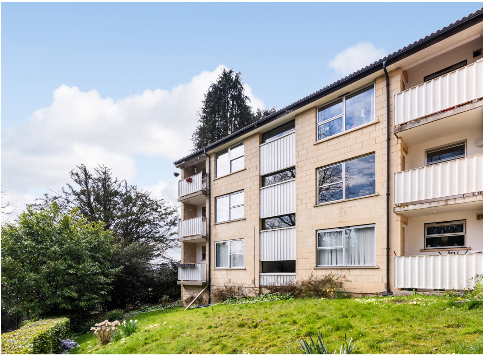
Weston Park West