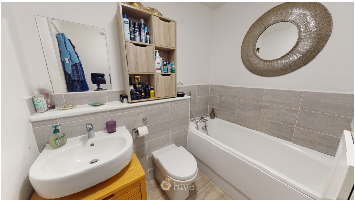
Bedroom & En Suite