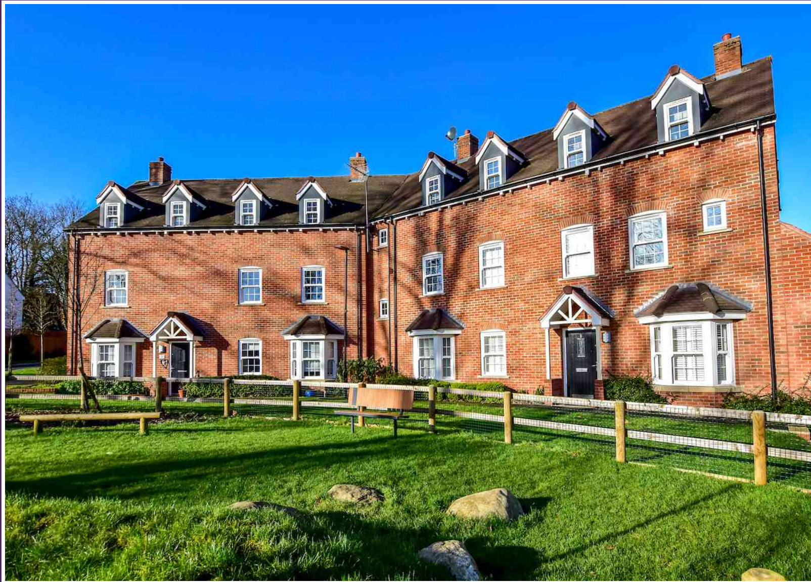
Quaker Court, Grange Road, Chalfont St Peter, Buckinghamshire. SL9 9FJ.