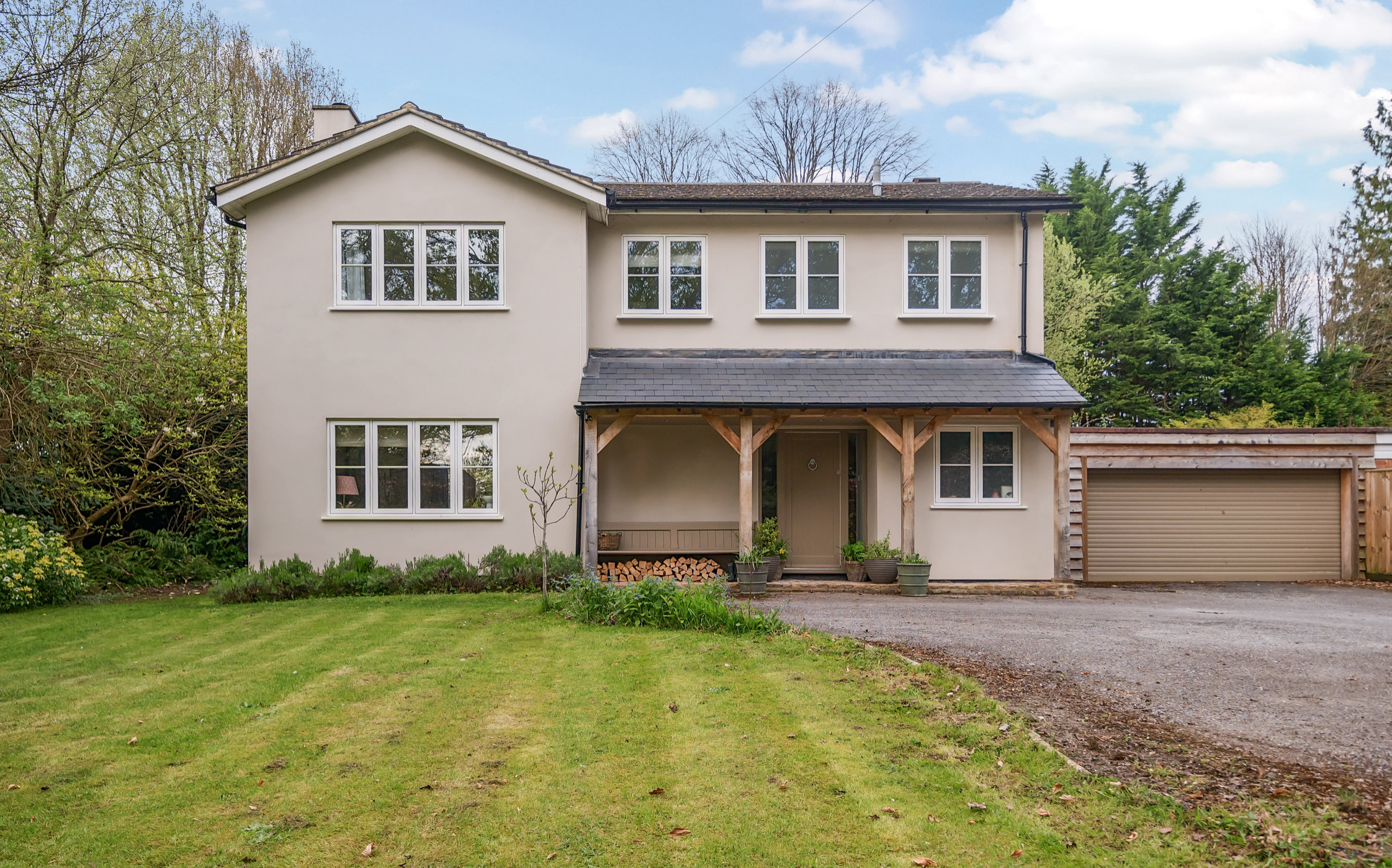
Ash House Crossways, Churt, Farnham, Surrey. GU10 2JU. Guide Price £1,000,000