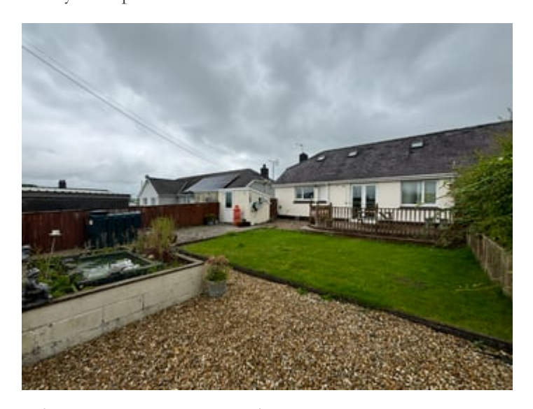
GARDEN (SECOND IMAGE)

A particular feature of this property is its generous rear lawned garden with a wooded raised decking area that steps down onto a level lawned and gravelled garden with an ornamental Fish pond. A highly appealing property perfectly suiting Family Occupiers.