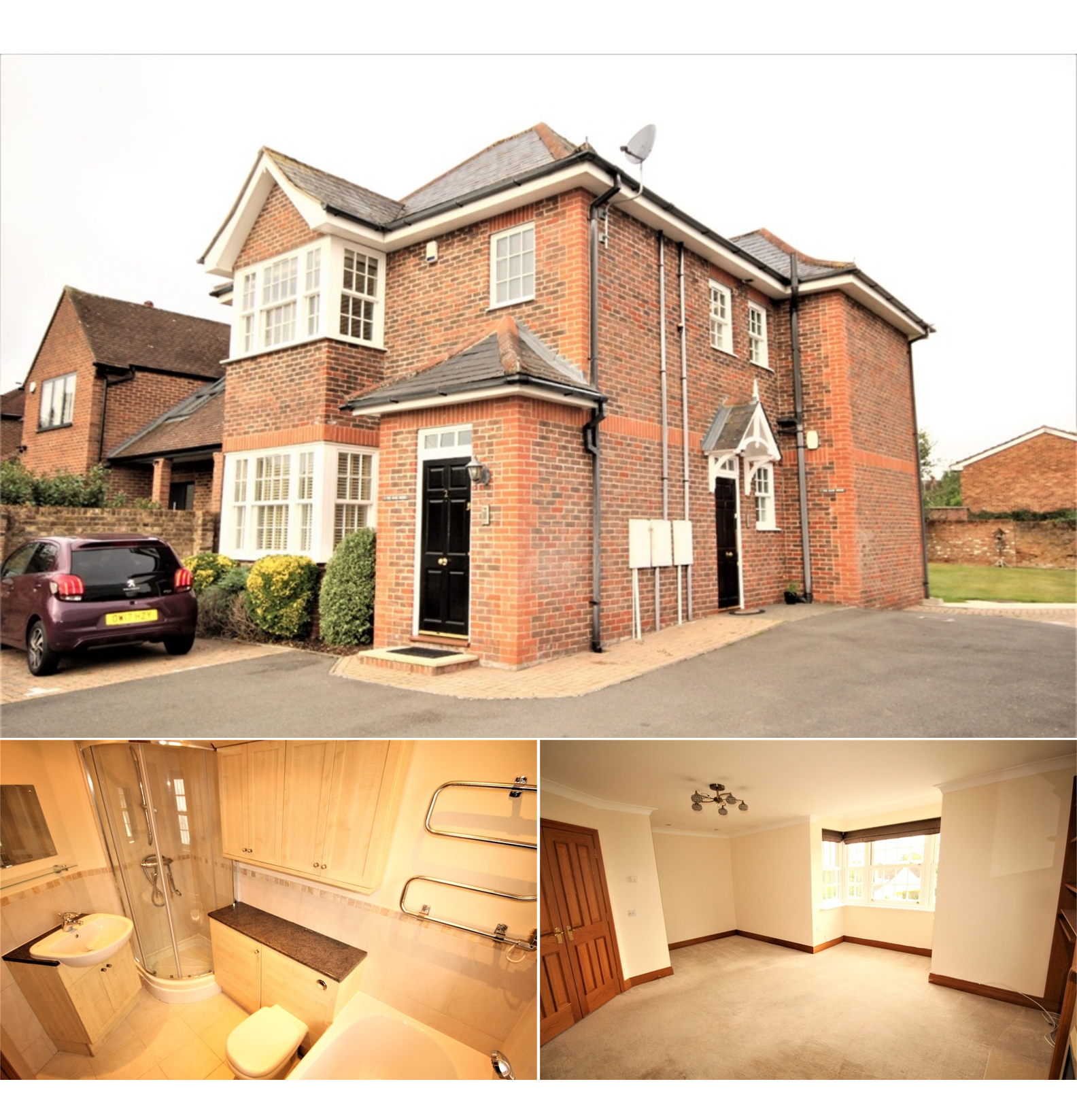
Layters Green Lane

Chalfont St Peter, Buckinghamshire, SL9 9JB