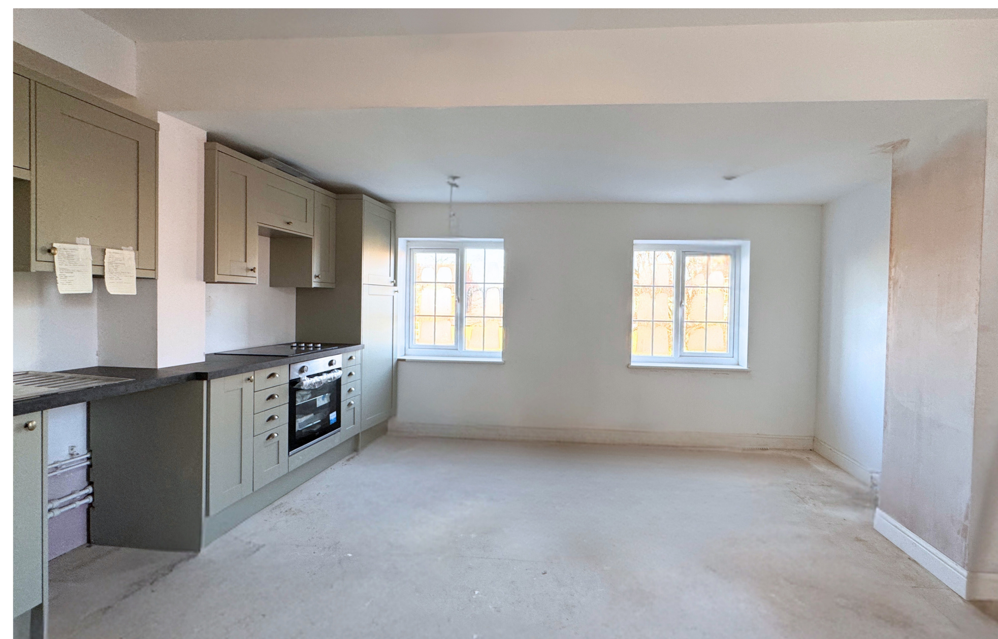
Kingsley Gardens | Northampton | NN2 7BW