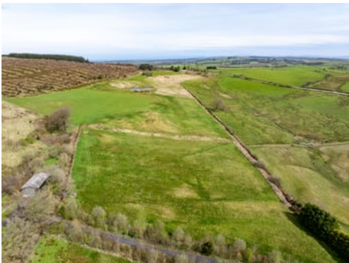
THE LAND (FOURTH IMAGE)