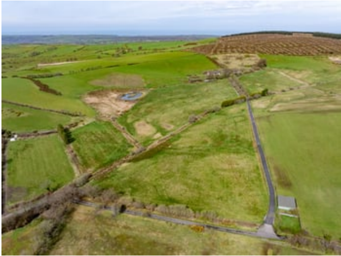
THE LAND (SECOND IMAGE)