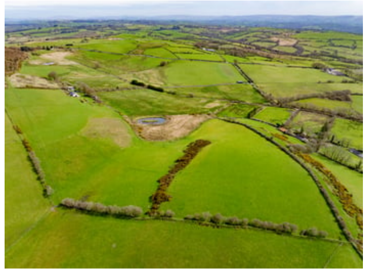
LAND (FIFTH IMAGE)