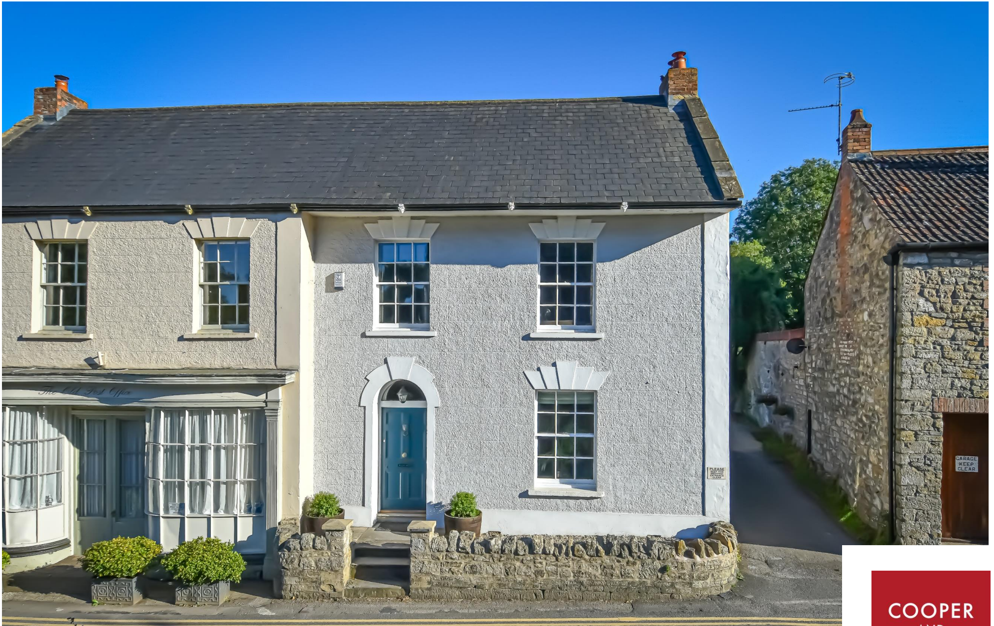
Brook House, Church Street, Wedmore BS28 4AA