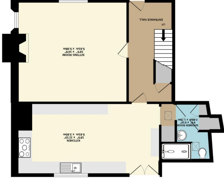
GROUND FLOOR 773 sq.ft. (71.8 sq.m.) approx.