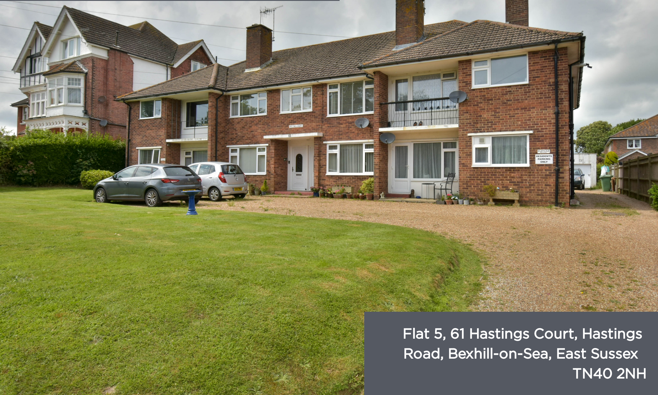
Flat 5, 61 Hastings Court, Hastings Road, Bexhill-on-Sea, East Sussex TN40 2NH