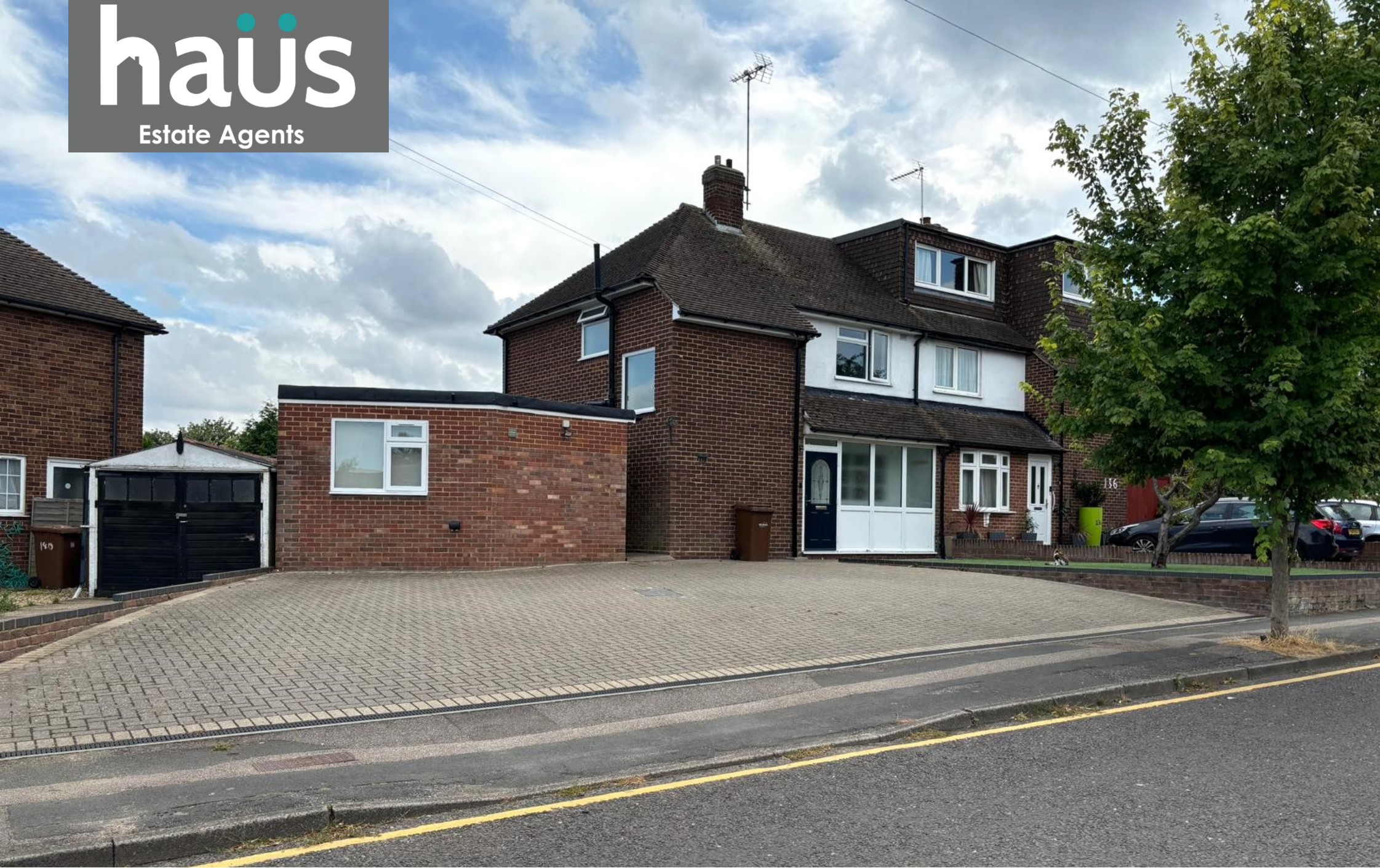
Three Bedroom Semi-Detached House Berengrave Lane , Rainham, Gillingham, Kent , ME8 7NL