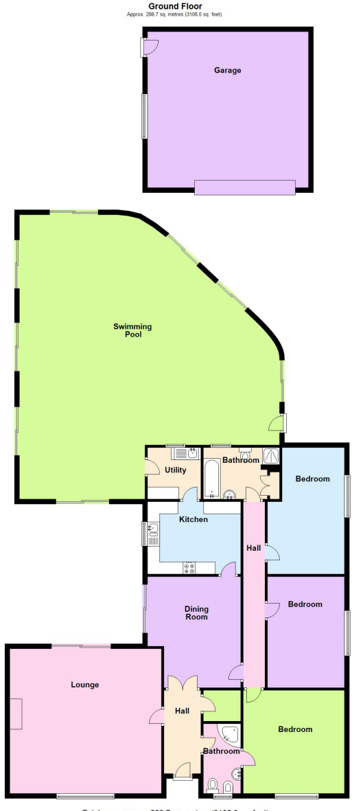
Total area: approx. 288.7 sq. metres (3108.0 sq. feet)