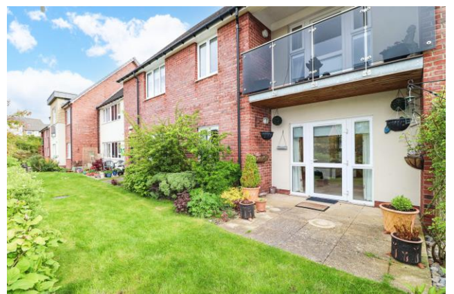
REAR OF THE PROPERTY