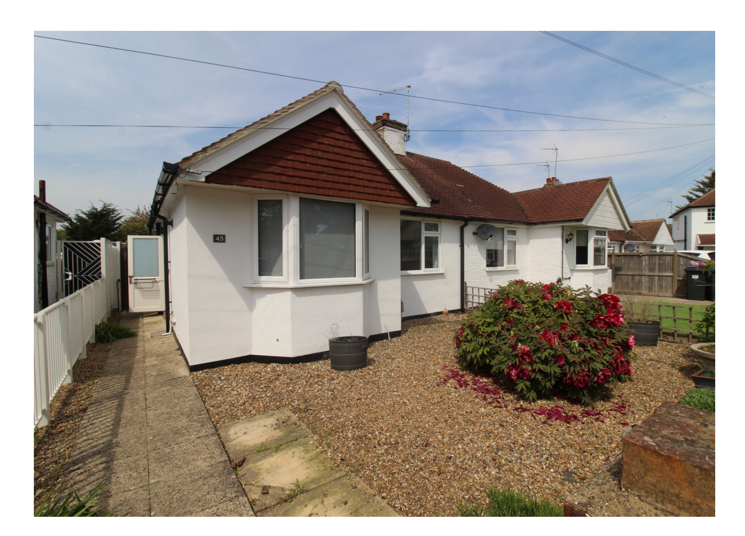
45 Greenhill Gardens, Herne Bay, Kent, CT6 8NX