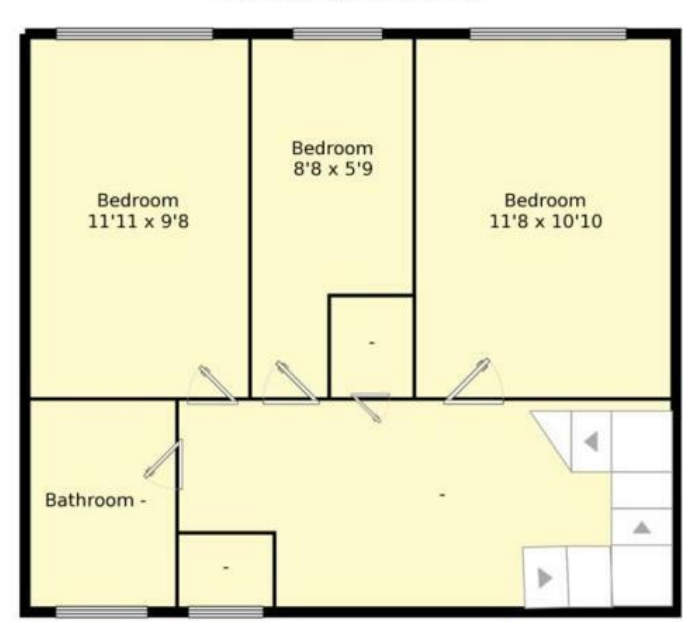
First Floor Floor Size: 25.4 m², 273.5 ft²

Measurements are approximate. Not to scale. For illustrative purposes only.