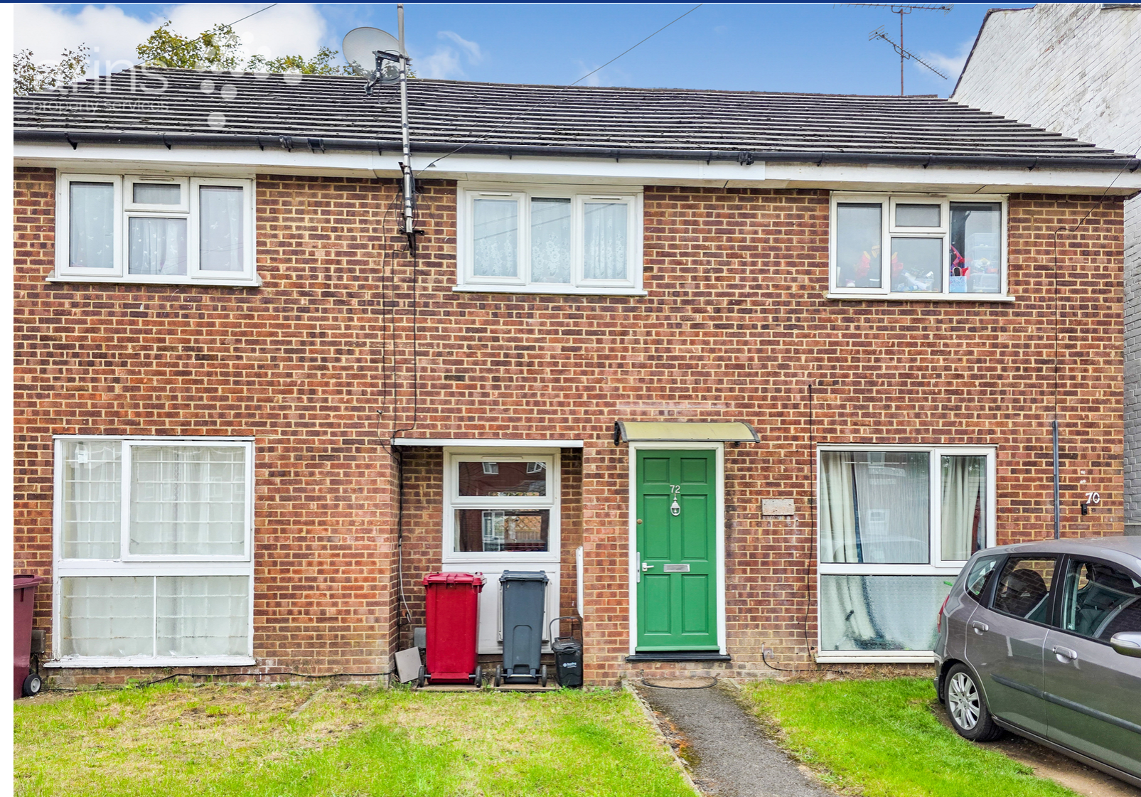
72 Orts Road, Reading, Berkshire. RG1 3JS.