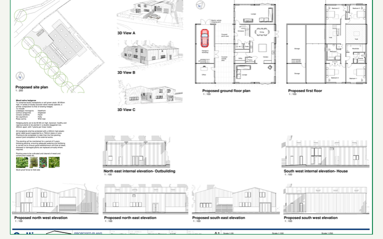
Price Guide £325,000