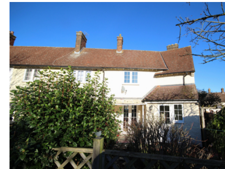
Jackmans Place, Letchworth Garden City, Hertfordshire, SG6 1RH