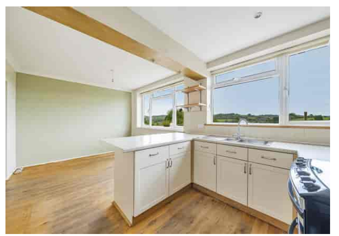
15 Worley Ridge, Nailsworth, Gloucestershire, GL6 0DP

Offered CHAIN FREE - a semi-detached family home in a sought-after road above Nailsworth, close to town and country, with wonderful views, three bedrooms, a large kitchen/dining room, flexible living space and a south-facing rear garden