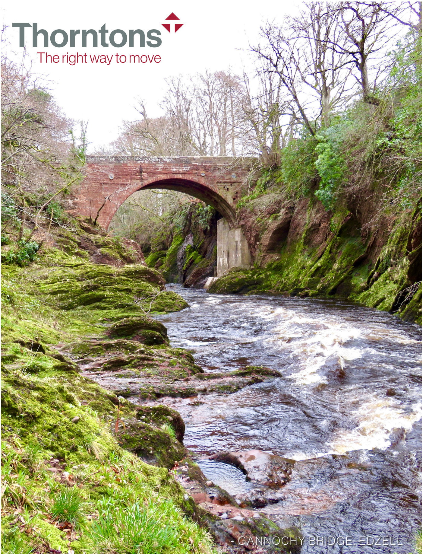
- GANNOCHY BRIDGE, EDZELL