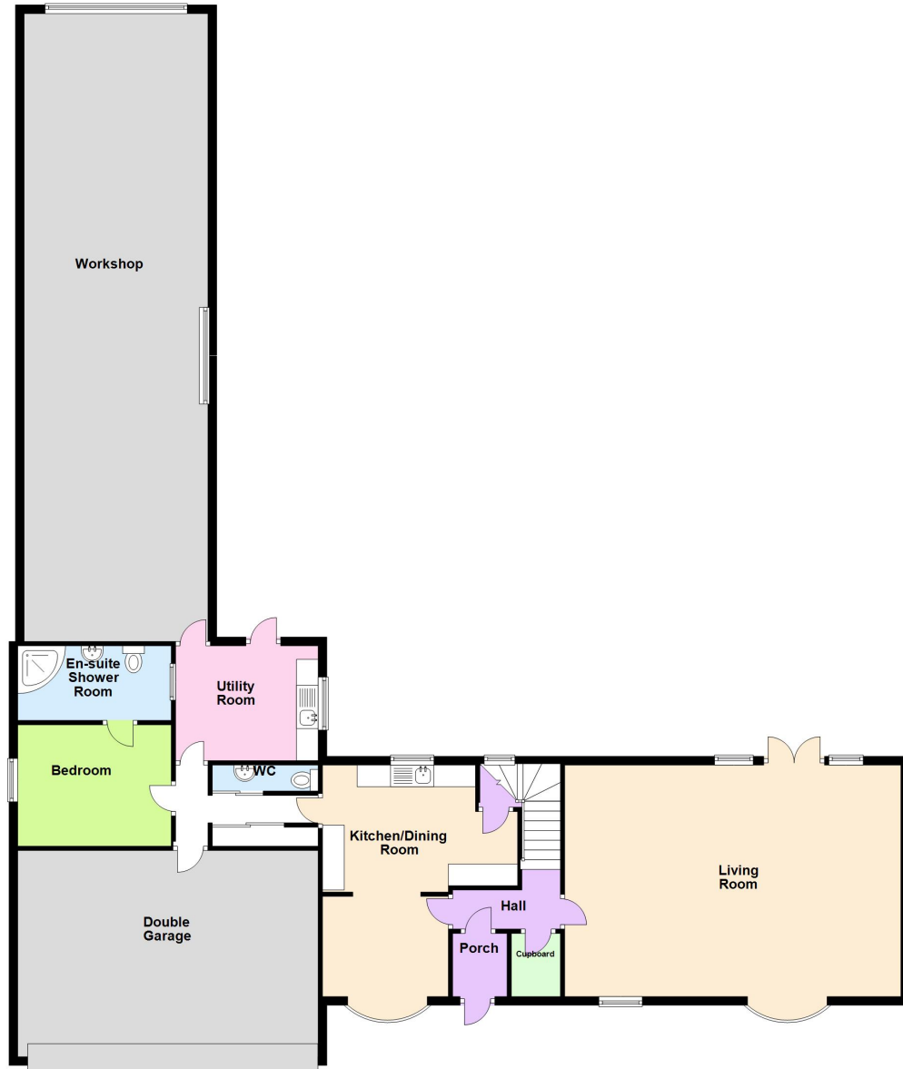
Ground Floor Approx. 199.4 sq. metres (2146.4 sq. feet)