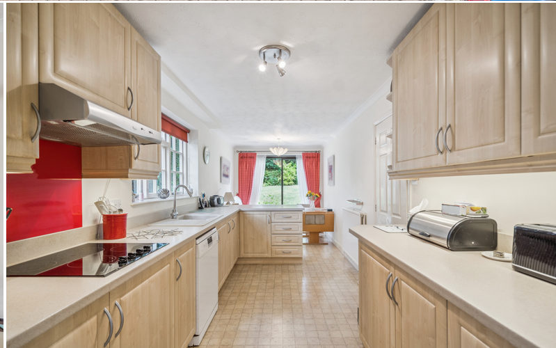
Cherry Acre Chalfont St Peter, Buckinghamshire, SL9 0SX