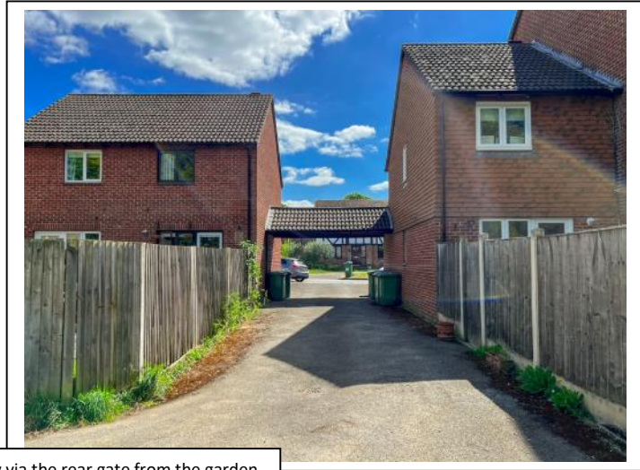
Parking which can be accessed directly via the rear gate from the garden