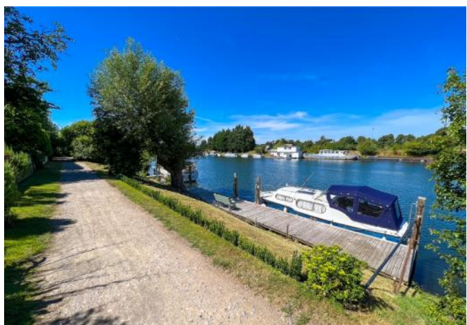
Towpath with River Thames beside leads from Hampton Court, through to Hurst Park recreational fields and onto Walton on Thames – Ideal for an afternoon stroll or dog walking