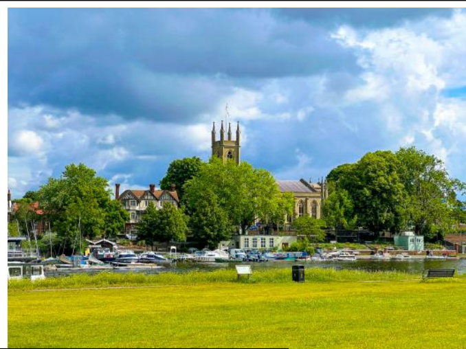
A selection of photographs of Hurst Park (Ideal for walking) with wonderful views St. Mary's Church in Hampton with footpath leading up to Hampton Court Place + train station and Walton on Thames