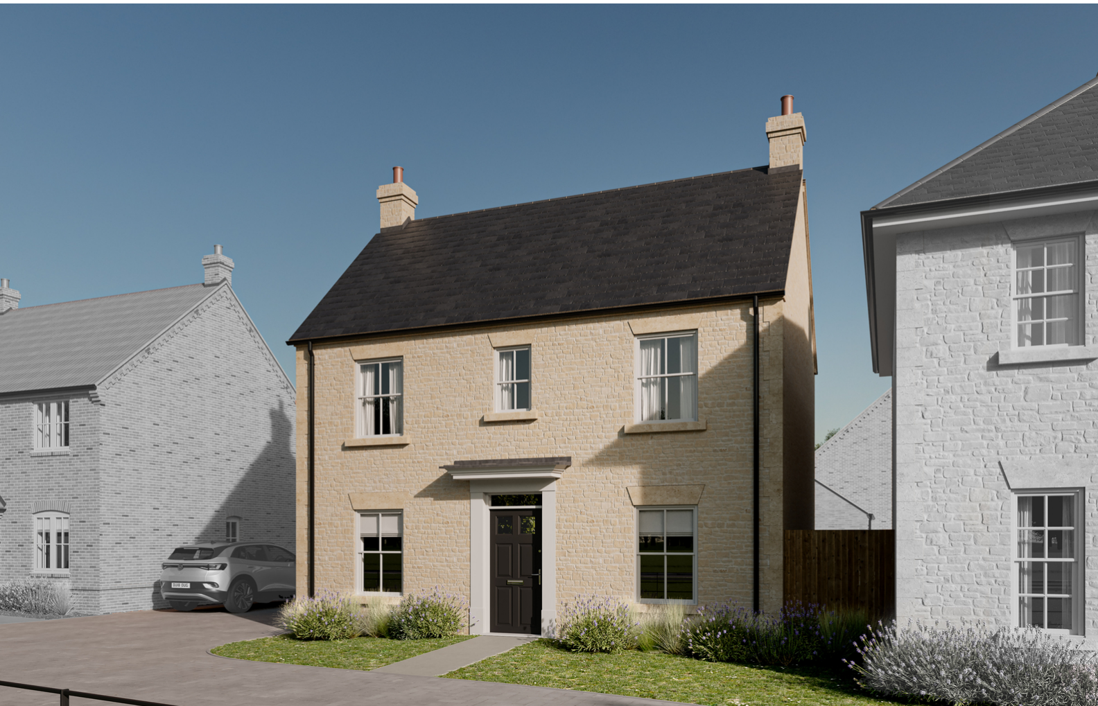
The Melton Plot 2, Damgate, Holbeach, Lincolnshire PE12 7AX