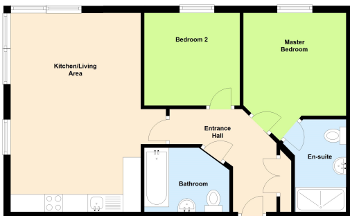
Total area: approx. 53.6 sq. metres Floor Plans are for layout purposes only. Plan produced using PlanUp.