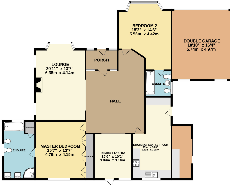
GROUND FLOOR 1975 sq.ft. (183.5 sq.m.) approx.