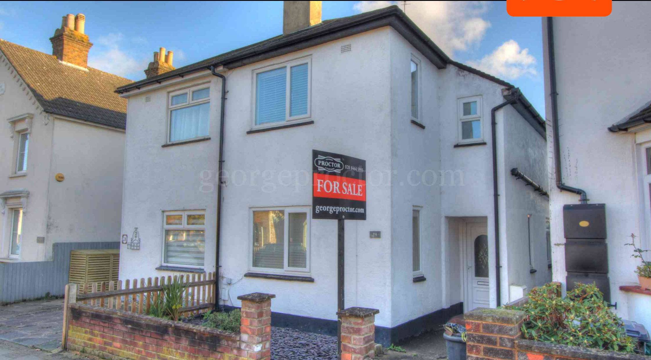
26 Johnson Road, Bromley, Kent. BR2 9SN