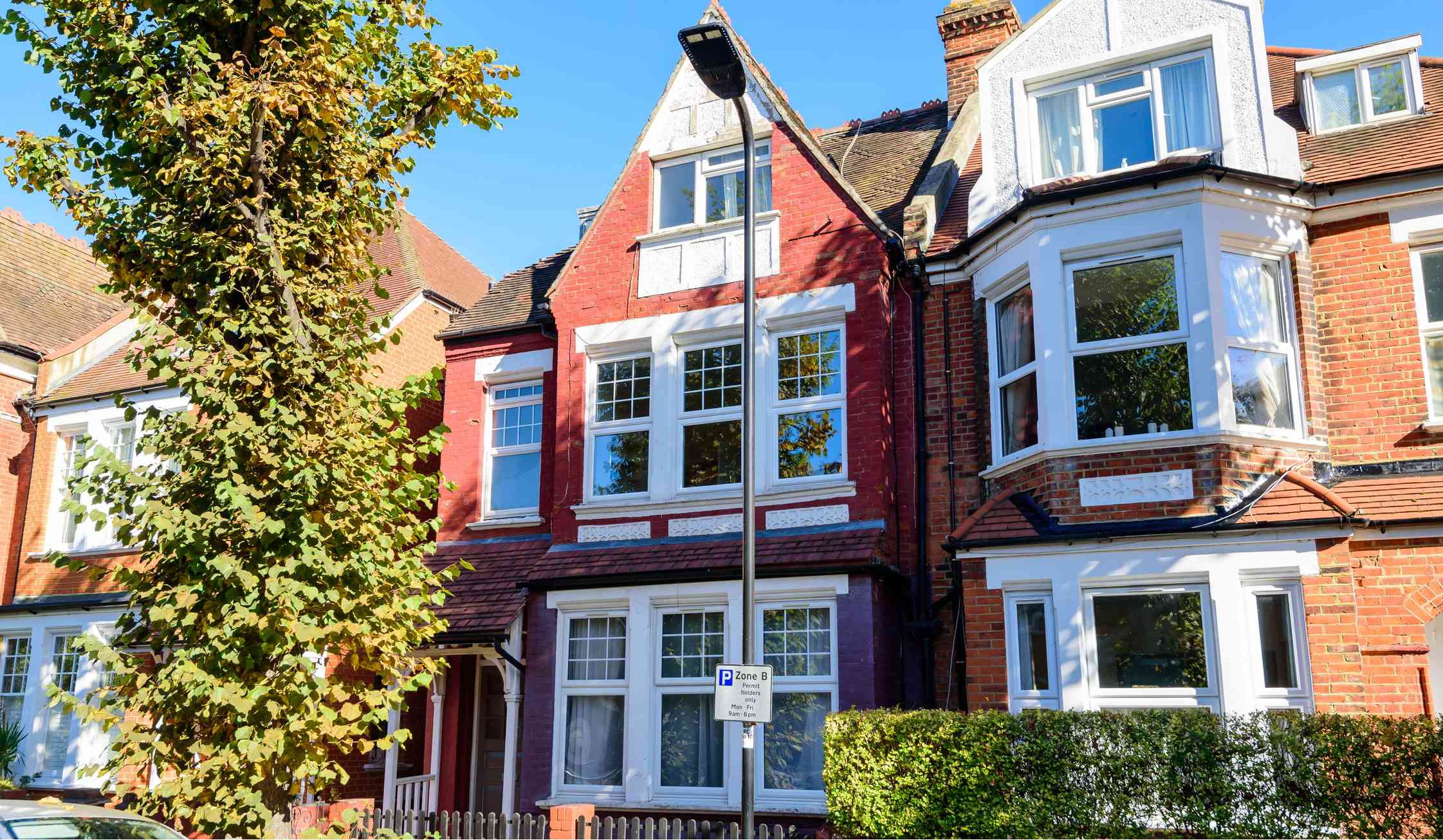
Ravenscroft Road, London, W4 5EQ