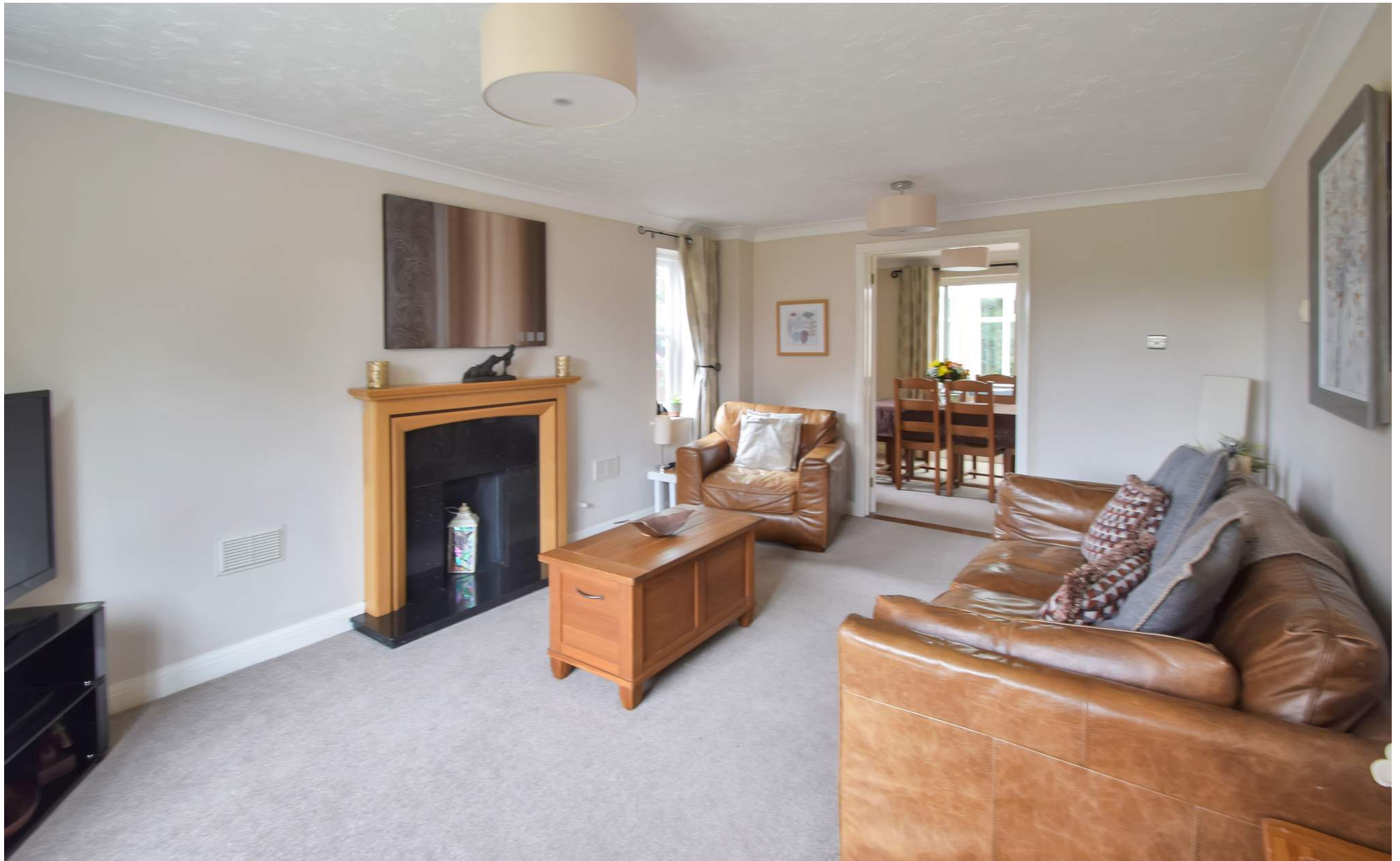
ROUND WOOD CLOSE, WALDESLADE WOODS,, WALDESLADE, CHATHAM, KENT, ME5 9UL