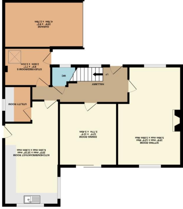
GROUND FLOOR 927 sq.ft. (86.2 sq.m.) approx.