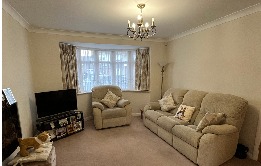
8 Southfields Avenue, Ashford, Surrey TW15 1LB £539,950 - Freehold