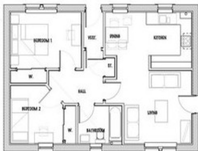
FLOOR PLAN Footprint area = 74.85sqm