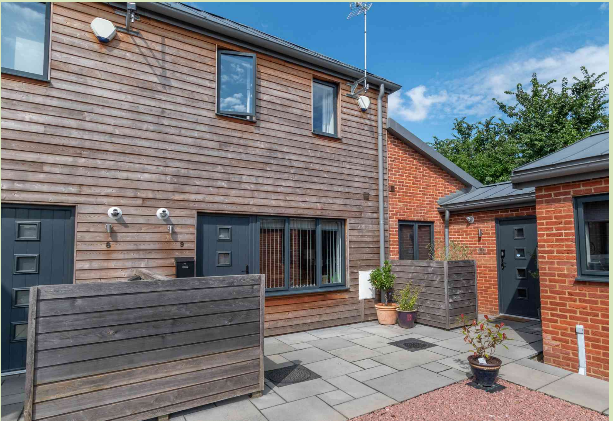
9 The Mews, Fakenham Offers in Region of £280,000