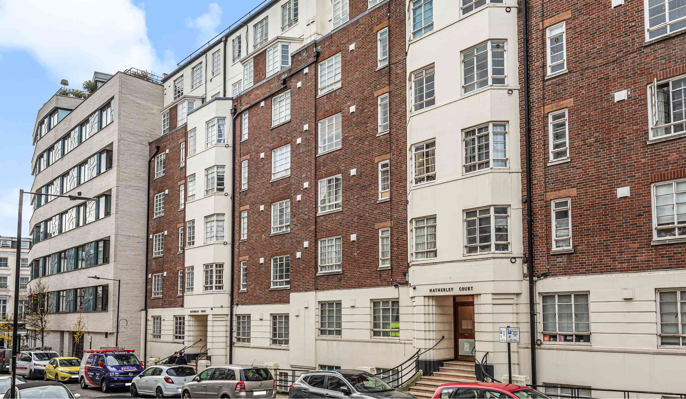
Hatherley Grove, London, W2 5RE