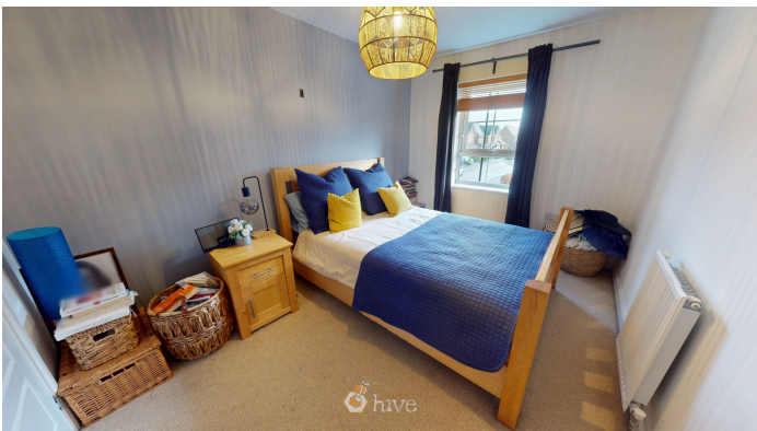
Master Bedroom & En Suite