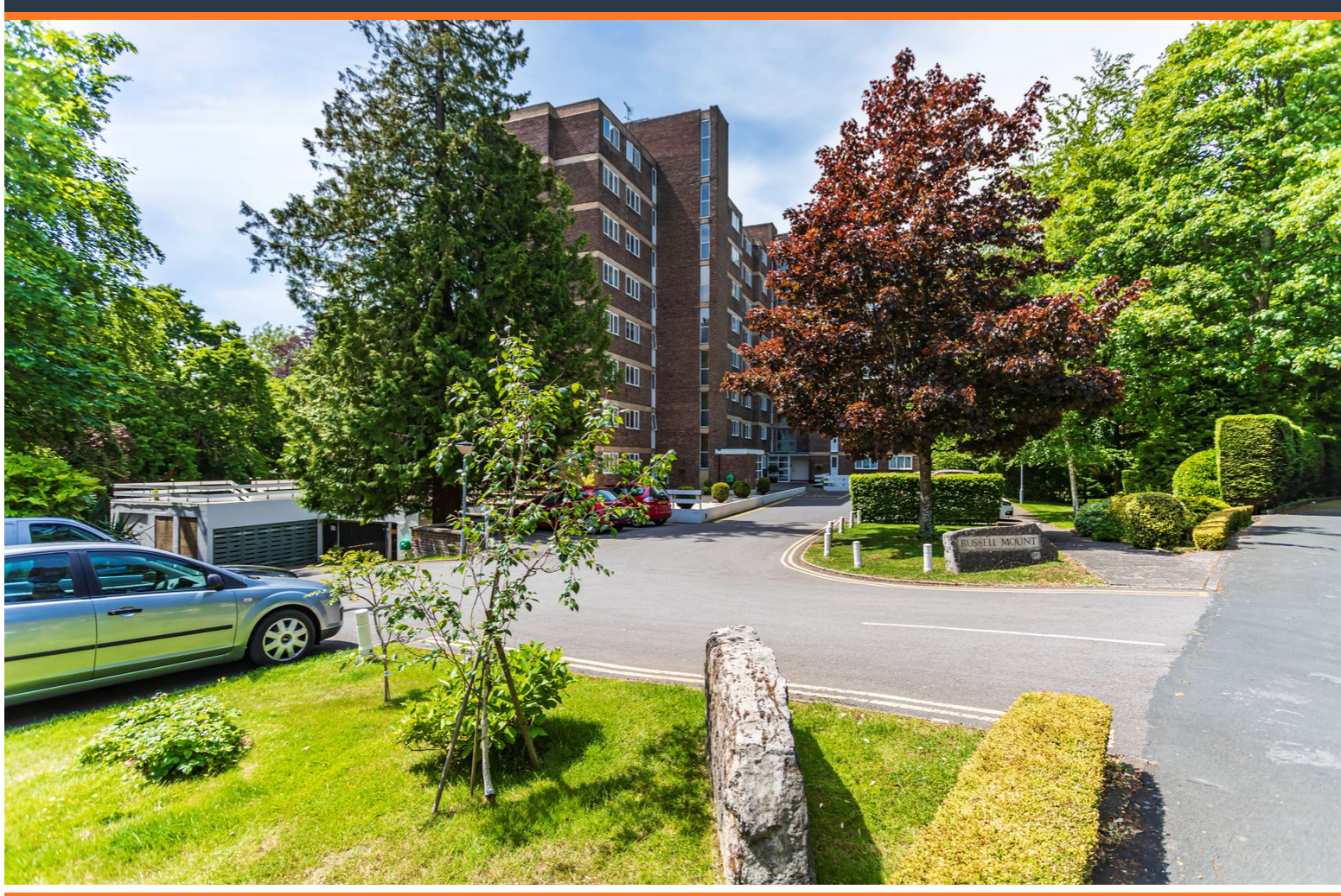
Flat 22, 28-30 Russell Mount, Branksome Wood Road, Bournemouth, Dorset, BH4 9JN Guide Price £210,000

** STUNNING VIEWS ACROSS BOURNEMOUTH ** Come and fall in love with this two-bedroom top floor apartment positioned on the popular Branksome Wood Road in Bournemouth. The apartment comprises of an array of fine features, few of which includes a spacious lounge diner with dual aspect windows, a separate kitchen, ample storage space, two spacious bedrooms, electric 'Rointe' heaters throughout, approximately 645 square feet of living accommodation, wrap around communal gardens with a washing line area, secure underground parking and direct access to the Bournemouth and Coy Pond gardens. A perfect first-time buyer in a truly great location. An internal viewing is a must.