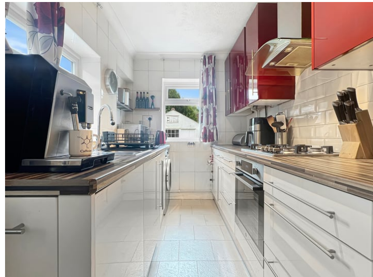
11' 6" x 6' 1" (3.51m x 1.85m)