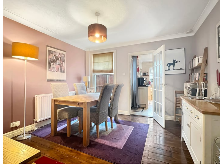
12' 8" x 11' 4" (3.86m x 3.45m)