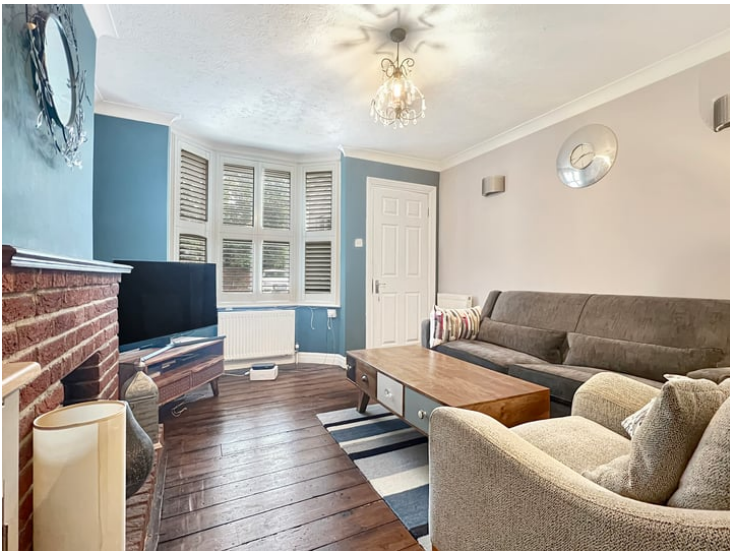
13' 2" x 11' 4" (4.01m x 3.45m)