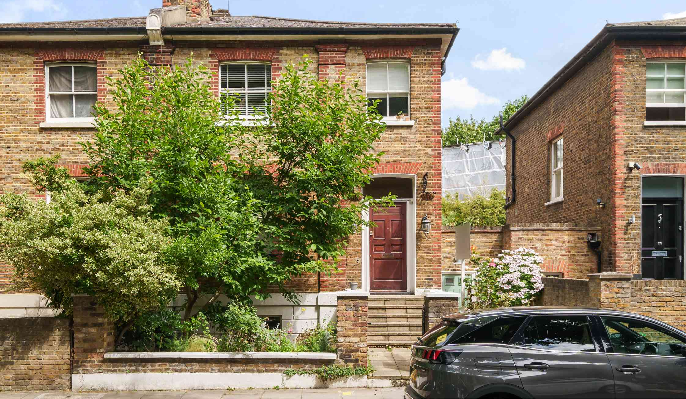
Bridge View, London, W6 9DD